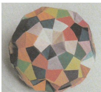
Figure 2. Truncated icosahedron from unit origami.

Thanks to my papers on molecular models with origami a big publisher Iwanami asked to write an introductory book of chemistry, but I hesitated to take an immediate action. Then I tried to use a paper envelope to make many molecular and crystal structures, and in 1983 I could write a book "To Grasp Chemistry" for high school students full of instructions for