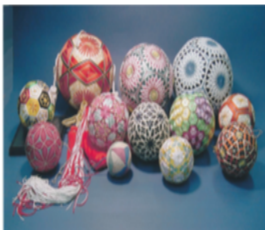
Figure 6. Modernized temaris in Japan.