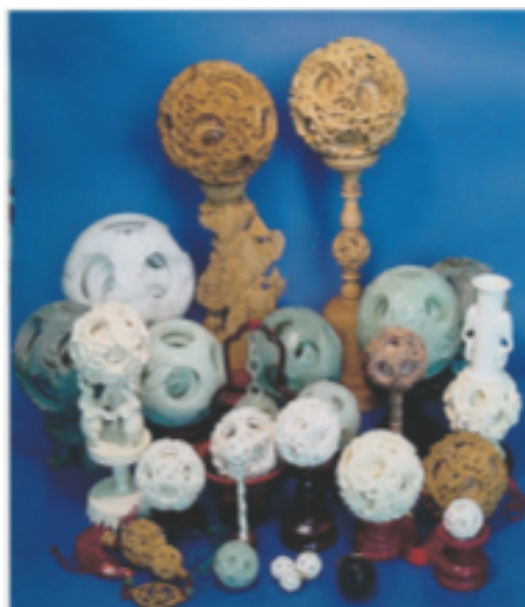
Figure 7. Multi-layered balls made in China.