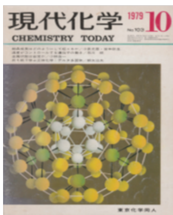
Figure 1. Cluster of B_{84} .

In my laboratory, however, in 1982 I could succeed in making an origami model of truncated icosahedron, which was introduced in my essay published in another popular journal of science (See Figure 2) [21]. It is constructed from 90 sheets of unit origami paper designed by Terada.