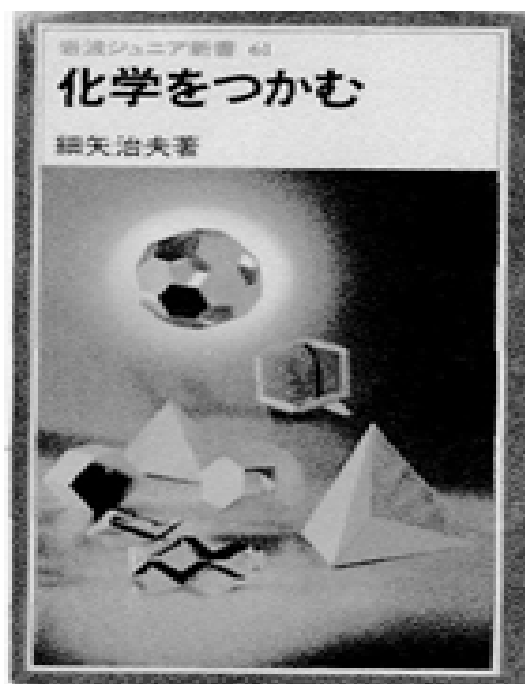
Figure 4. Cover of "To Grasp Chemistry".

into a number of smaller feasible subgraphs by using ad hoc giant recursion formulas. After filling up a whole big notebook I could obtain the final result, but I had no confidence in my result, except for the highly factorable last term, or perfect matching number, of 12500 = 2^2 \times 5^5 . What a beautiful result it was. Then I submitted my paper "Matching and Symmetry of Graphs" to Computers and Mathematics with Applications as I was invited by Hargittai to contribute to its special issue [23]. It was published in 1986, and was adopted into a book "Symmetry Unifying Human Understanding" [12].